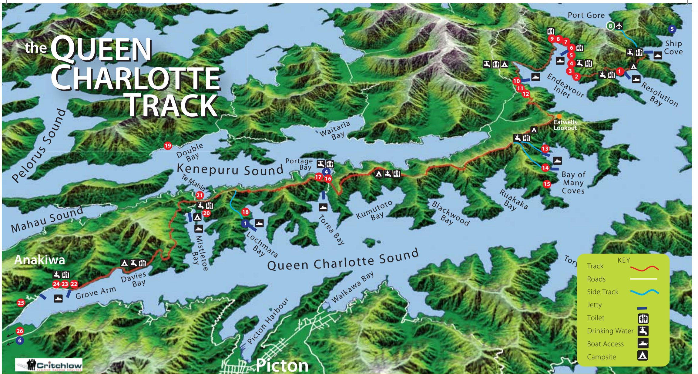
The Track Gradient Map